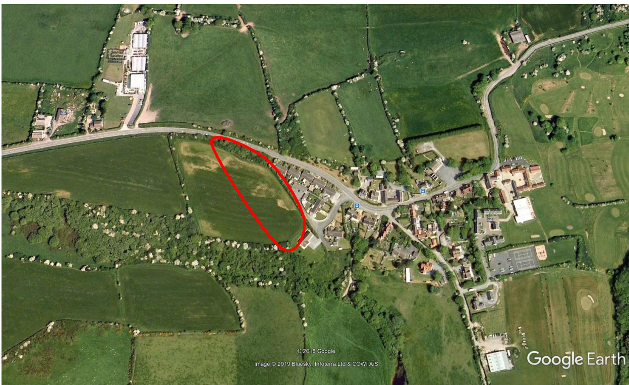
Aerial photograph of proposed site