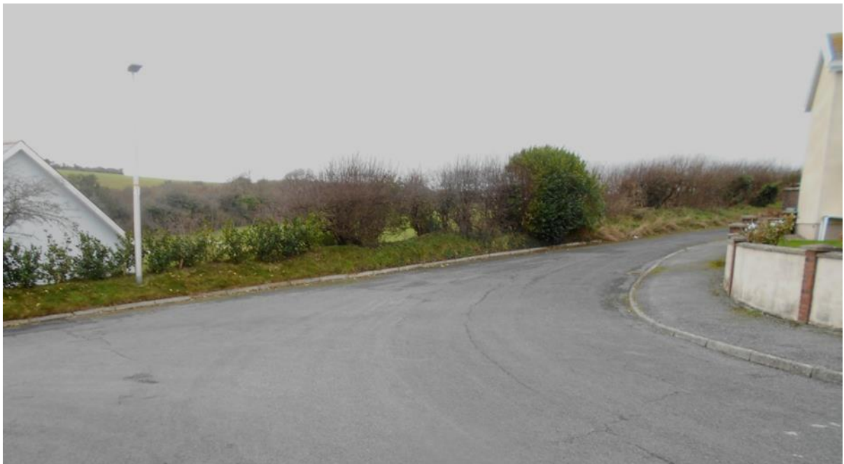
Alternative access from existing estate road