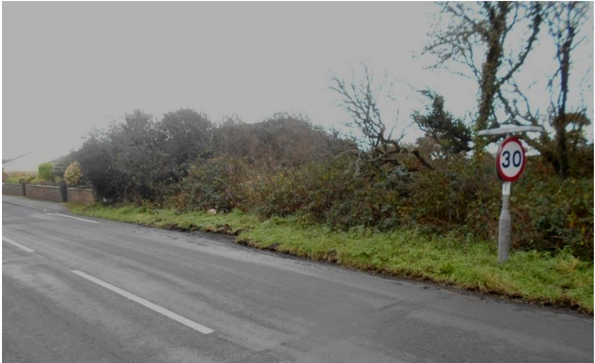
Potential access point and existing roadside 'hedge' within the 30mph limit