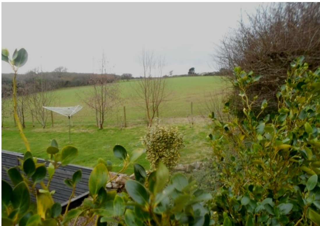
View of initially proposed candidate site in the middle ground and, in the foreground, the current proposal