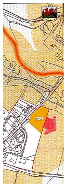
C29 Newport/ Trefdraeth

2.1 It is therefore considered appropriate for the Focussed Change site to show an arrow indicating the potential release of further land to the east as is the current case for the smaller settlement of Lydstep, namely HA11. Please see below scan of LDP2 Proposed Maps (with Newport map marked)