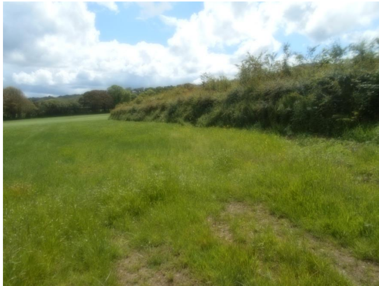
Southern boundary hedge to HA3 and showing further mature hedge to rear of applicants' ownership

In respect of HA3, earlier proposals by the NPA indicate that the 15 property site should be developed in two stages; “the NPA envisages only 10 homes will be completed in the five year period 2026-2031 leaving the remaining 5 to be completed post 2031” (Source:- Appendix 2 Housing land Supply as at April 2018 by NPA and as referred to in our Focussed Change submission dated 13 th February 2019).