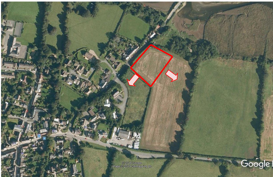
Aerial photograph of Focussed Change site