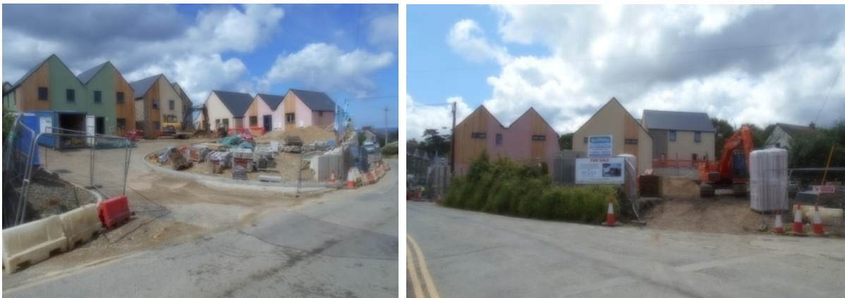
Former Pottery Site HA2. Social housing units near completion and view looking south of the commenced second phase for market housing

In respect of HA2, the site which is being developed in two stages; the first stage for 8 social housing properties for local needs also by Wales and West is almost complete whilst the second stage which is for four market properties has recently commenced.