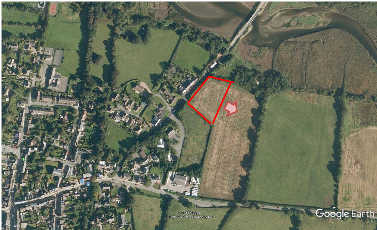
Aerial photograph of Focused Change site