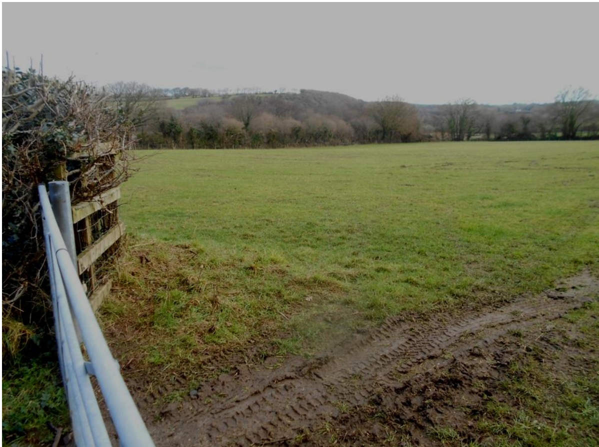
View across Candidate Site 88A showing existing screening on the northern boundary. Field slopes from south to north