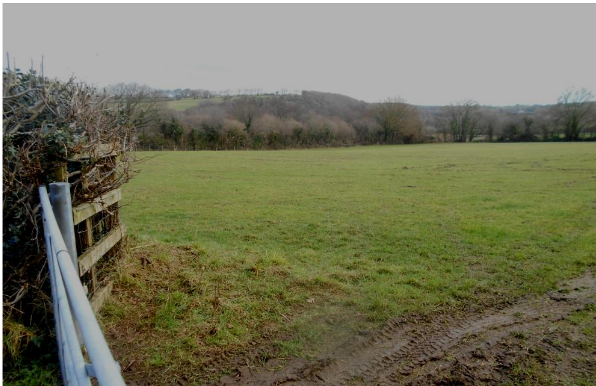
View across Candidate Site 88A showing existing screening on the northern boundary. Field slopes gently from south to north