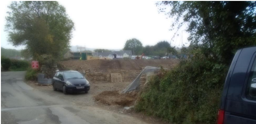
Site HA1. Access point from Feidr Bentinck to 35 unit site of which 14 are affordable homes. There is a second access from Feidr Eglwys

In respect of HA1, which is described to be for 35 properties of which 14 are for affordable housing (by Wales and West Housing Association), the site is now advanced and units are being completed..