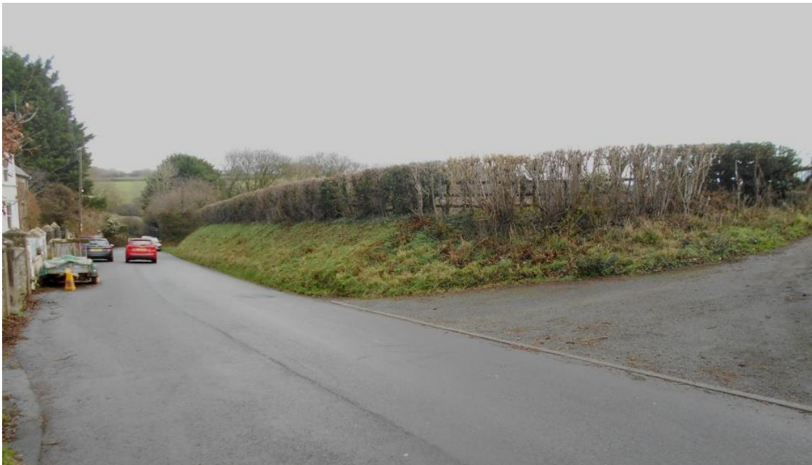
Candidate Site Reference 88A Feidr Pen-y-Bont, Newport showing existing field access and roadside hedge. Site slopes from south to north. Existing residential properties lie to the left